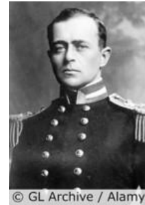
Captain Robert Scott