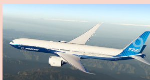
'Boeing 777X' 2022