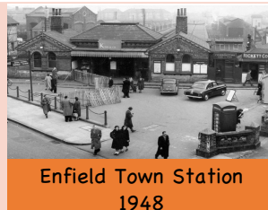
Enfield Town Station 1948