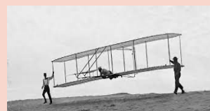
'The Wright Flyer' 1903