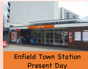
Enfield Town Station Present Day