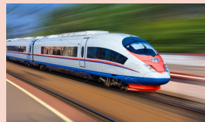
'The Maglev' fastest train 2022