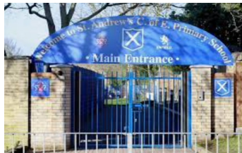
St Andrew's School