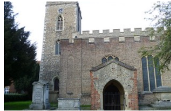
St Andrew's Church