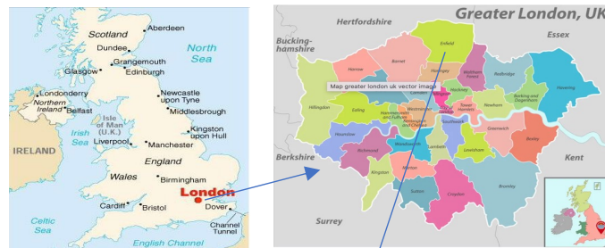
London Borough of Enfield Ward Map, 2002-present